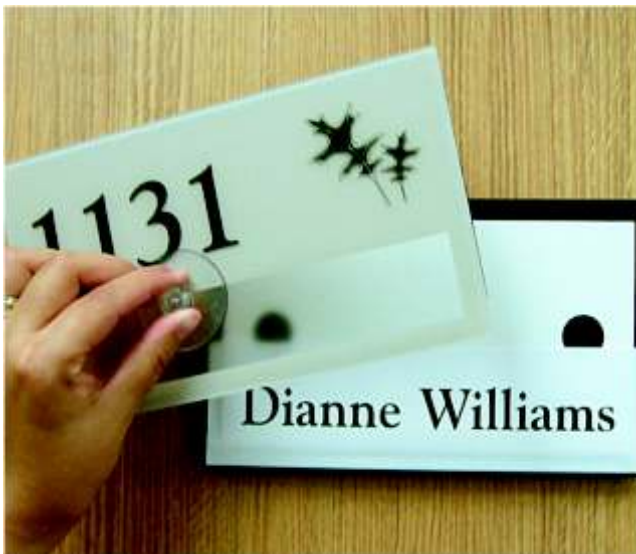
Remove face with magnetic strips from back plate