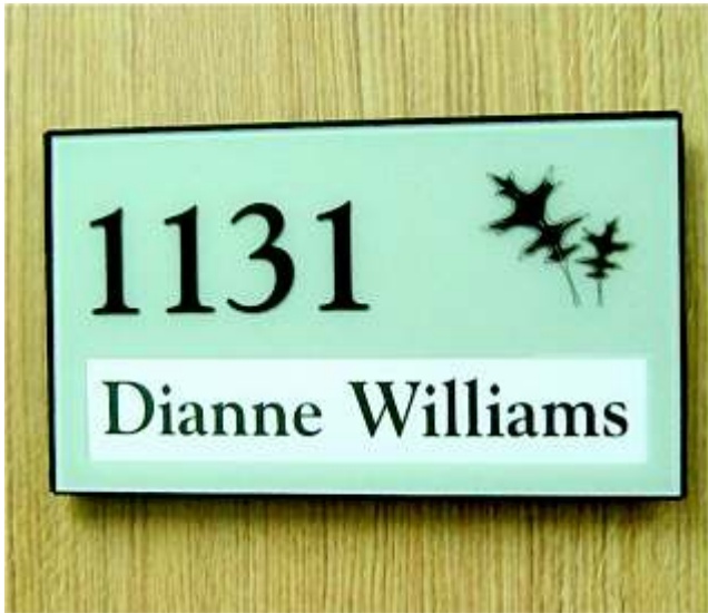
T2B Tablet with existing insert