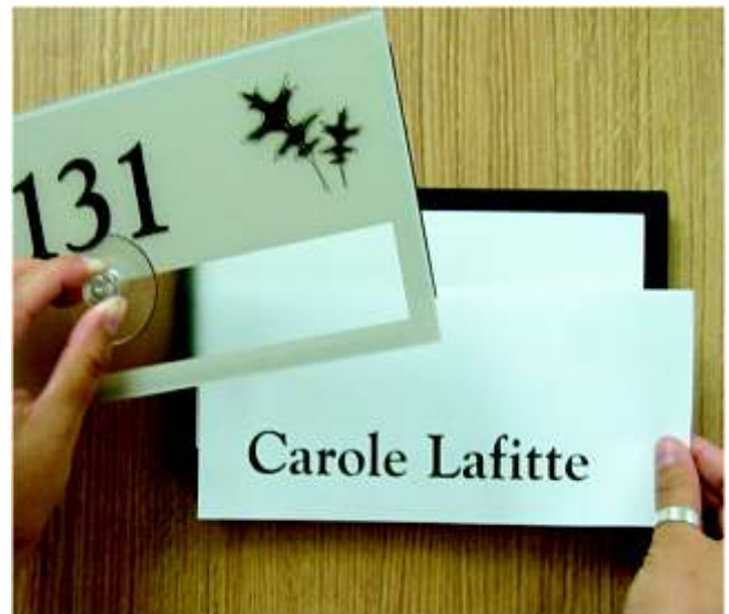
Put in new insert and replace face

The Tablet sign holder was developed for locations where public safety or other critical considerations require tightly controlled access to sign inserts. The information displayed looks permanent yet inserts can be changed and updated in seconds using the tool provided.