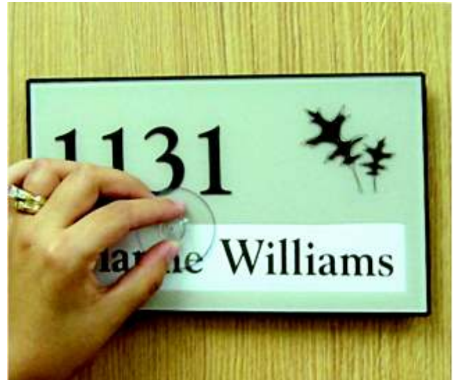
Press suction cup to tablet face